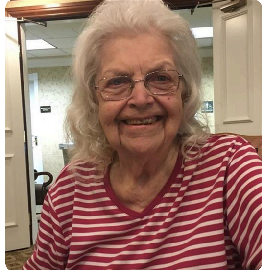
Mom on her last birthday.