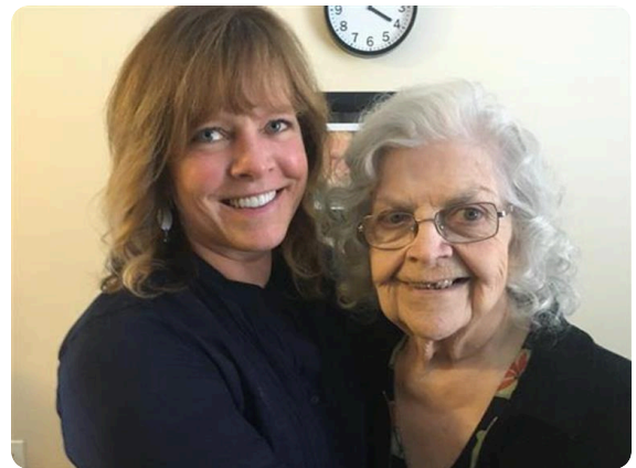
Daughter and Mother