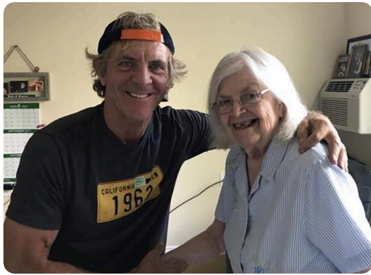
Son and Mother