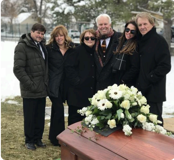
Children and Spouses