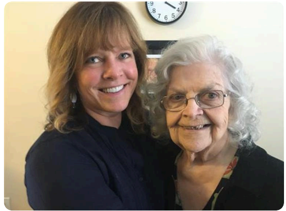
Daughter and Mother