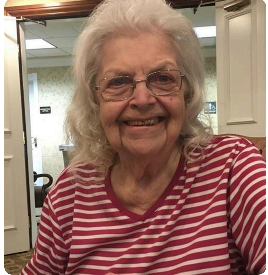
Mom on her last birthday.